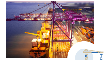
Crane · Girder